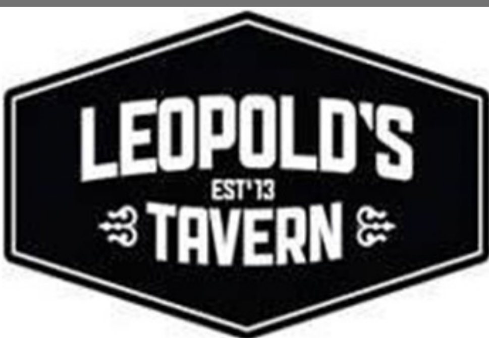
Leopold's Tavern In search of 3,200 - 3,800 Sq Ft