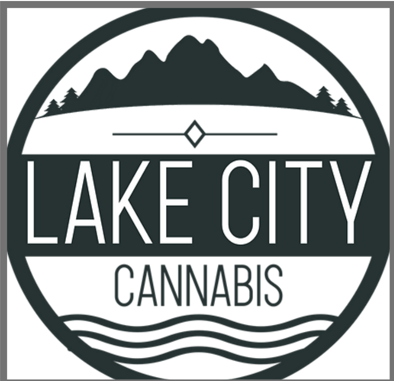
Lake City Cannabis In search of 1,000 - 1,200 Sq Ft