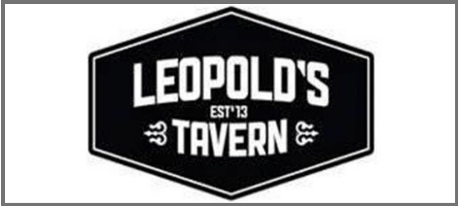
Leopold's Tavern In search of 3,200 - 3,800 Sq Ft