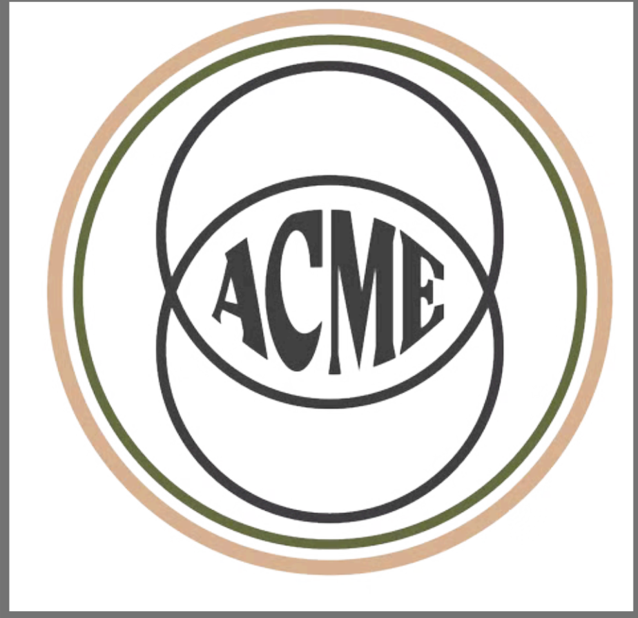
Acme Pizza Co. In search of 1,000 - 3,000 Sq Ft