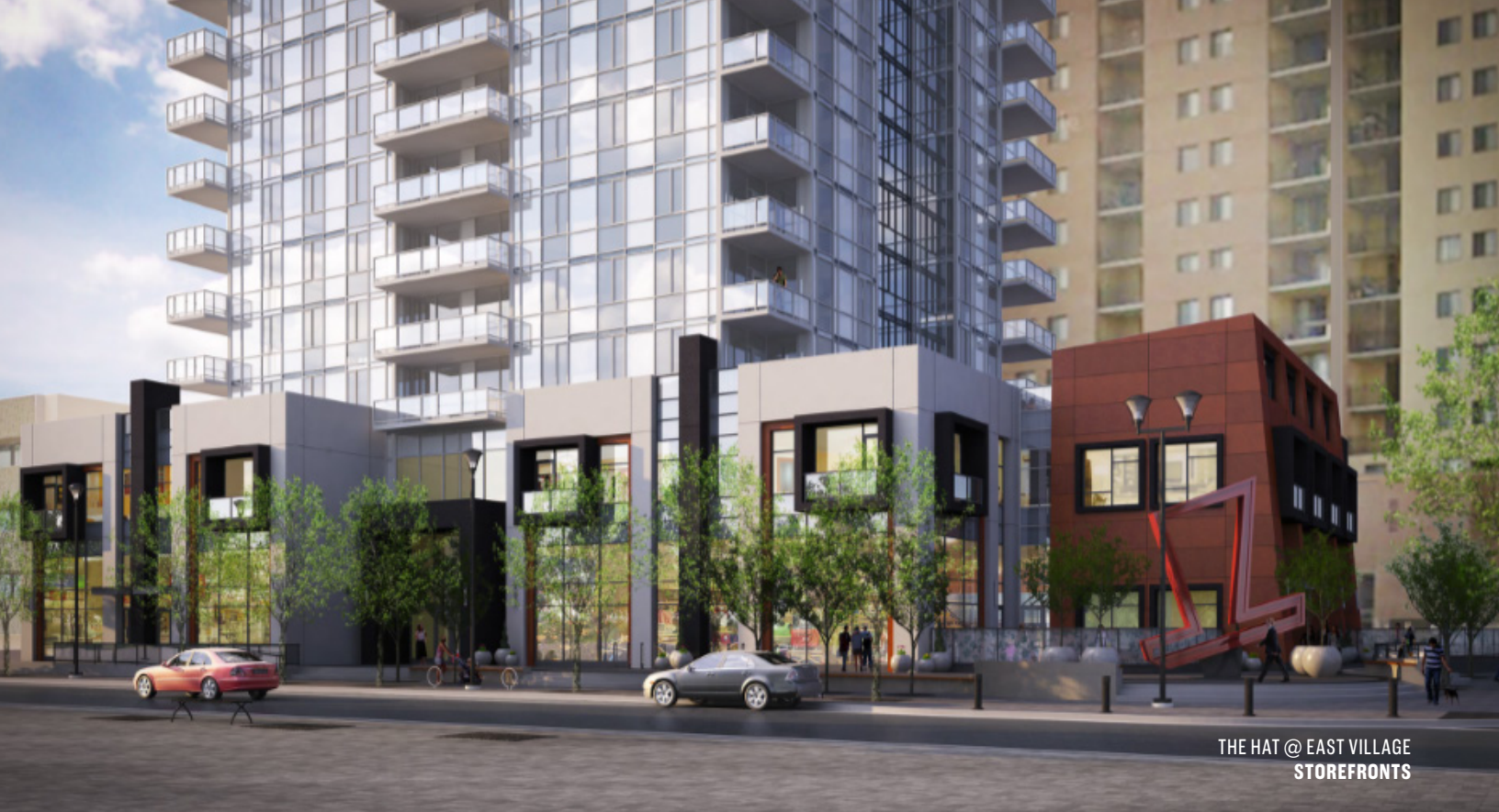
THE HAT @ EAST VILLAGE STOREFRONTS